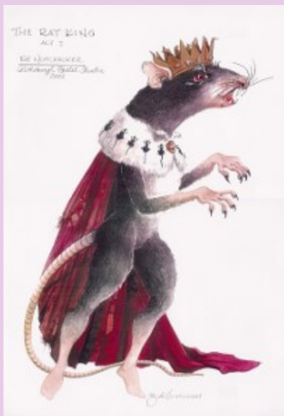
The Rat King