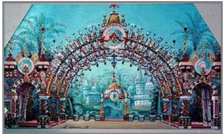
Original sketch for the set of The Nutcracker , Act II, 1892

The Nutcracker premiered at the Mariinsky Theatre in December 1892, along with Tchaikovsky's opera, Iolanta , which was performed first. (In France it was common to present a ballet following an opera; Russia sometimes adopted this French tradition.) The audience and critical reaction to the ballet was mixed. Critics