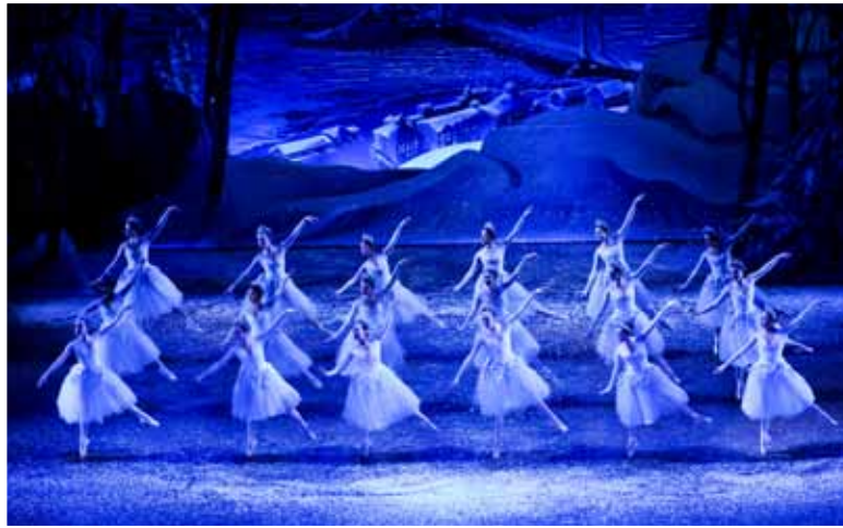
People on Stage